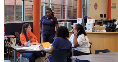
Small Group Intervention Training