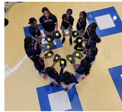
Lady Royal Lions Softball Team