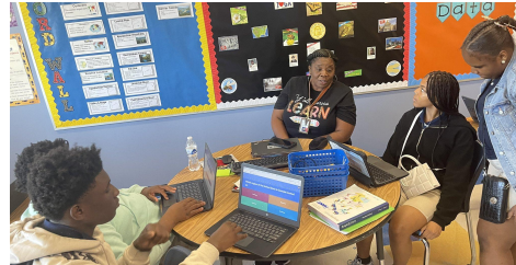
8th Grade Small Group Instruction