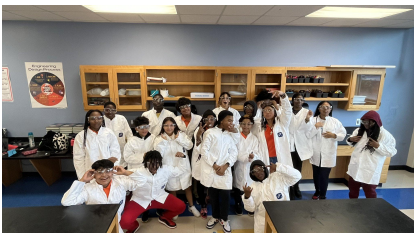
7th Grade 1st Biology Lab